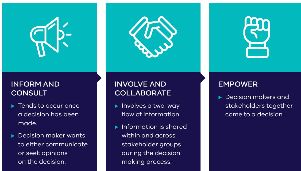
Figure 2: IAP2 Levels of engagement

The VMC Civic Participation Kit is aimed at the middle level – consult, involve and collaborate . This includes a two-way flow of information – organisations sharing information within and across stakeholder groups during the decision making process.