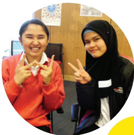
Pictured above: VMC Dandenong Youth Forum, 2015

The report is available on the Commission's website at: http://www.multicultural.vic.gov.au/images/2016/SocialCohesionInSheppartonandMilduraOct2015WEB.pdf