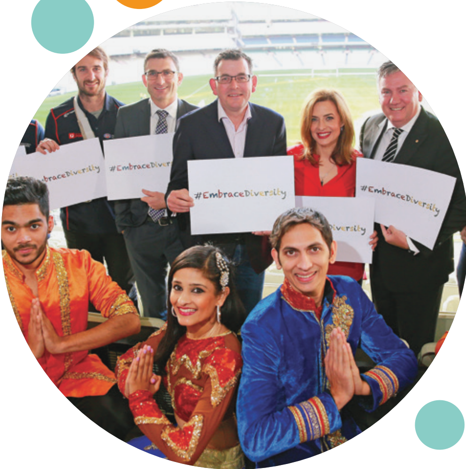
Pictured above: Embrace Diversity campaign