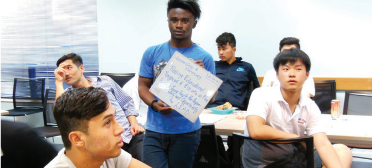
Pictured above: VMC Ballarat Youth Forum, 2015

Topics discussed at RAC meetings, and used to inform the Minister, included the following: