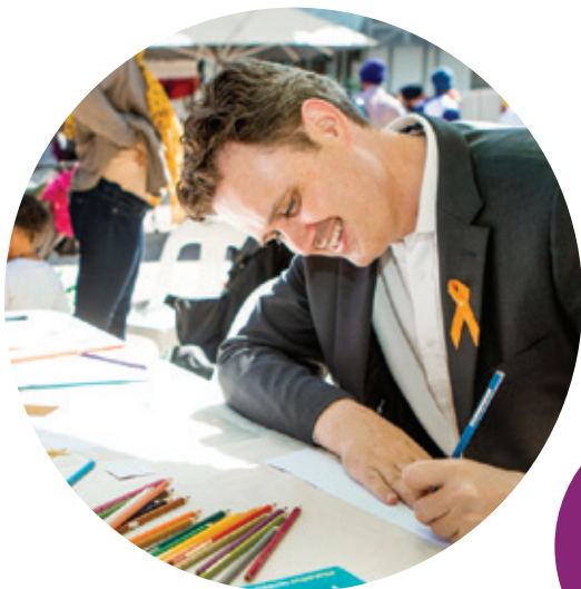
Pictured above: Victoria's Multicultural Festival, March 2016

Once ratified, recommendations were reviewed by the Chairperson for endorsement before being sent to the Minister for approval. This new process allowed the Commissioners to bring their knowledge of culturally diverse communities and Commission priorities to the grants process.