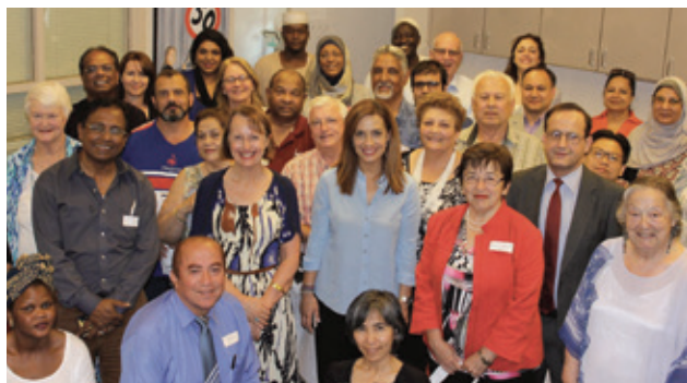
Pictured below: Community Forum, Narre Warren South