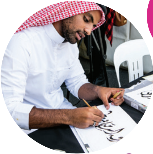
Pictured below: CDW, March 2016