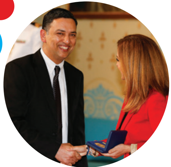
Pictured below: Awards for Excellence, December 2015

This year over 400 artworks were submitted to the competition from around 31 schools. Winners were selected by VMC Commissioners based on their creativity and originality in relation to the theme and were presented with certificates by the Minister for Multicultural Affairs in a ceremony during the Festival.