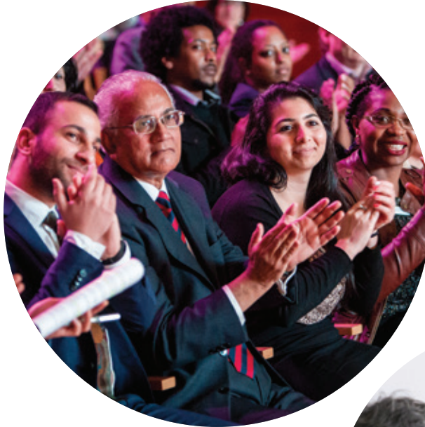
Pictured below: VMC Public Lecture, November 2015