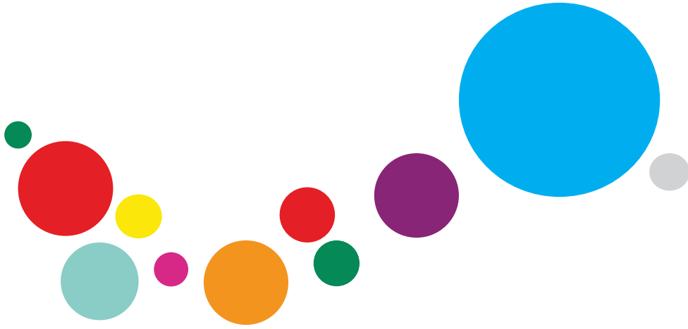
Pictured above: VMC Public Lecture, November 2015

The key indicators for successful settlement include: