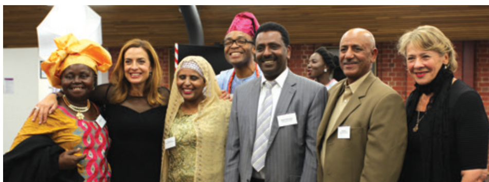
Pictured left: Jewish African Communities Friendship Dinner, May 2016.

It is clear we are a voice at the table for our diverse community members in a wide variety of policy areas.