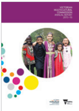
Front cover: Schools Engagement CDW, March 2016