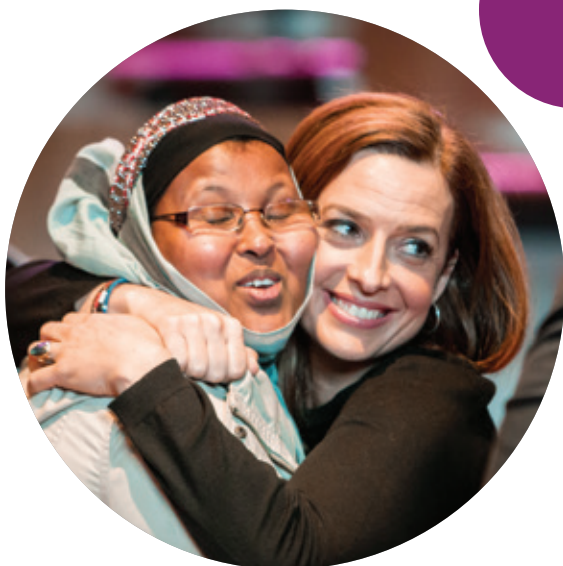
Pictured left: VMC Public Lecture, June 2016

Following the Federal Government's commitment to a one-off increase of 12,000 permanent humanitarian places for Syrian and Iraqi refugees in Australia, the Commission was requested by the Premier to lead the settlement coordination of Victoria's humanitarian intake in 2016-2017.