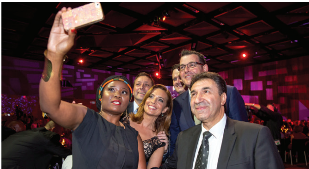
Pictured below: Premier's Gala Dinner, March 2016