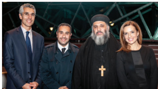
Pictured below: VMC Public Lecture, June 2016

The Commission in leading successful place-based community engagement requires being flexible and responsive to community needs. Recent community conversations with a group of South Sudanese mothers in a lounge room in Melton West enabled us to relate these findings to an earlier consultation with young people from the South Sudanese community. The knowledge we have gathered from these consultations has informed the development of policies and programs administered by other government departments and agencies.